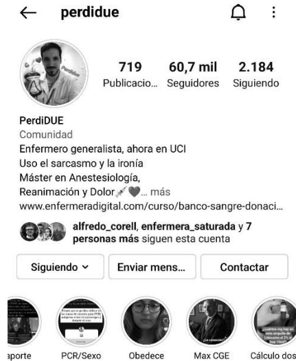
Figure 5. Bio and some highlights from @perdidue's profile

generally with images from the media - or to disseminate them as they are, and in them, the use of text within the video itself to explain some aspect of it stands out. And this practice of using other people's material is also used in the publications of still images, which are also accompanied by text, but without any visual identity. When he makes his own videos, he uses the selfie shot, speaking directly to the camera, as he does in the stories, which are very numerous and many of them appear grouped into themes in the profile highlights (see Figure 5).