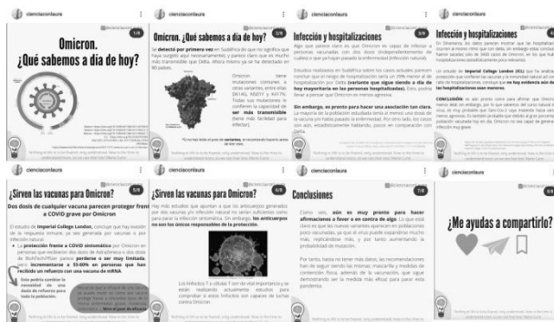
Figure 4. Slides that make up a publication in Carousel by Laura Taina