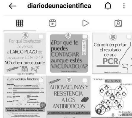
Figure 2. Publications by @diariodeunacientifica

Despite having had to open another profile, as of 20 March 2022, @diariodeunacientifica had a community of more than 42,000 followers, had published 55 posts and numerous stories, one of the formats most used by the populariser on Instagram. During the period analysed, Almagro had made 22 posts, of which 59.1% were carousels of text and illustration images, 27.3% were video reels, 9.1% were single-image posts and 4.5% were video posts. In this regard, it should be noted that Lucía Almagro has developed a visual identity for all her publications -especially in the still images, but also in many of her videos-, which brings unity and coherence to the profile (see Figure 2).